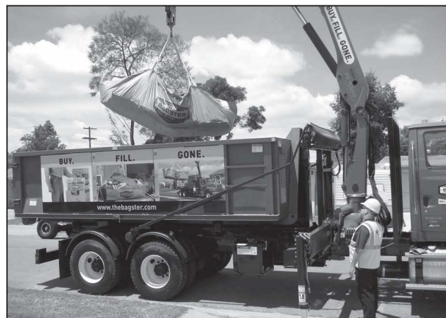
WASTE MANAGEMENT ORANGE COUNTY

The Bagster is a new supersized trash bag that holds up to 3,300 pounds of trash, green waste or recyclables.