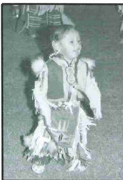
Children have their traditional dances as well.

Continued from page 1 referred to a Native American council or religious meeting of spiritual leaders. The modern day Powwow is rooted in a Pawnee religious ceremony from the 19 th century and was adopted by Omaha and others who added speech-making, gift giving and feasting. By the 60s and expansion of contact between Indian communities inter-tribal Powwow became more common and a tradition for natives who had lost many old traditions. It was seen as a nation-wide symbol of Indian identity.