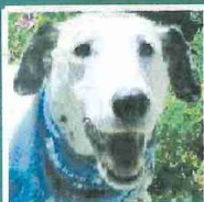
Meet Perdita page 23