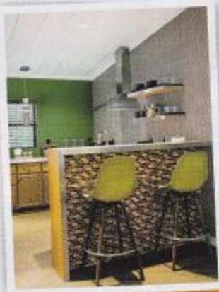
A kitchenette in one of the Redwood Cabin suites